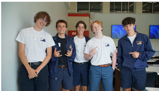
Burke City participants in the Moot Court

Participants used real legal cases, followed courtroom procedures, and built arguments based on provided evidence and a legal study guide. With a guest attorney serving as judge, teams examined witnesses, raised objections, and passionately defended their sides.