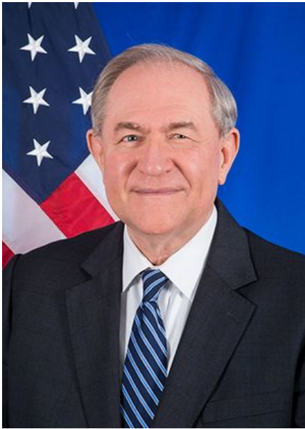
James Gilmore, Official Portrait

A Richmond born, lifelong Republican, and UVA alumni—James Gilmore was 68th Governor of the commonwealth of Virginia and a former ambassador of the US embassy. Gilmore's speech talked about how he got into politics and what inspired him to pursue his career. One day he's out campaigning for his friend, and the next he's running for Governor. Throughout his speech, he conveyed the message of being committed to what you're doing, as seen in his example on his approach to politics. Gilmore then discussed the Ukraine and Russia war, in which he said "Negotiation is overrated." This quote promotes his outlook on American patriotism and the threat from communist countries. In his speech, he personally talked about his intolerance for communist countries and the importance of American values. He stands on the defense of democracy and will defend it at any cost.