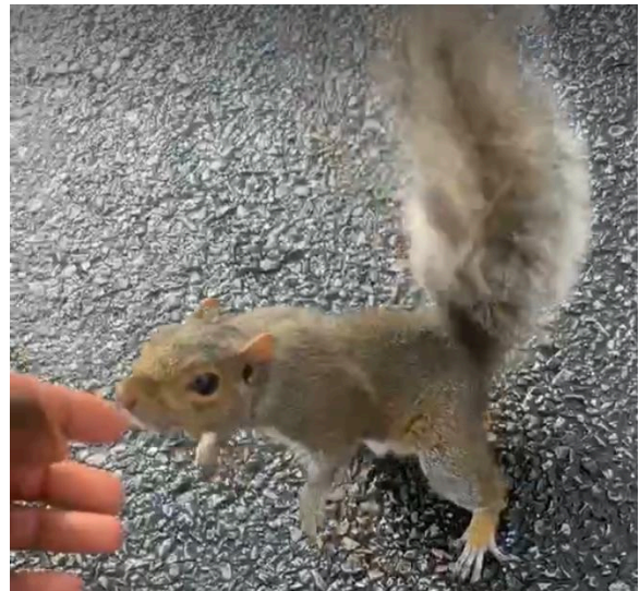
A screenshot from the anonymous citizen's video of them touching a Radford squirrel on the sidewalk

to view this video. Aside from watching Bob Ross as a child and seeing him allow his domesticated red squirrels to climb across him, I have never seen any squirrel act in such a way. It is truly a beauty of Boys State and Radford to have these furry friends accompany us across the campus and provide some entertainment through this week.