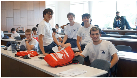
Patton City participants in the Moot Court

One of the most intense activities at Boys State, the Moot Court, turned delegates into prosecutors, defense attorneys, judges, and jury members in a simulated trial centered on the fictional possession and distribution of a drug mixture of marijuana and cocaine.