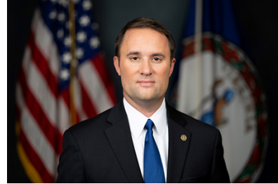
Jason Miyares, Official Portrait

that while America was not perfect, "what we have is "special" leaving Boys State citizens with food for thought regarding the future of their country.