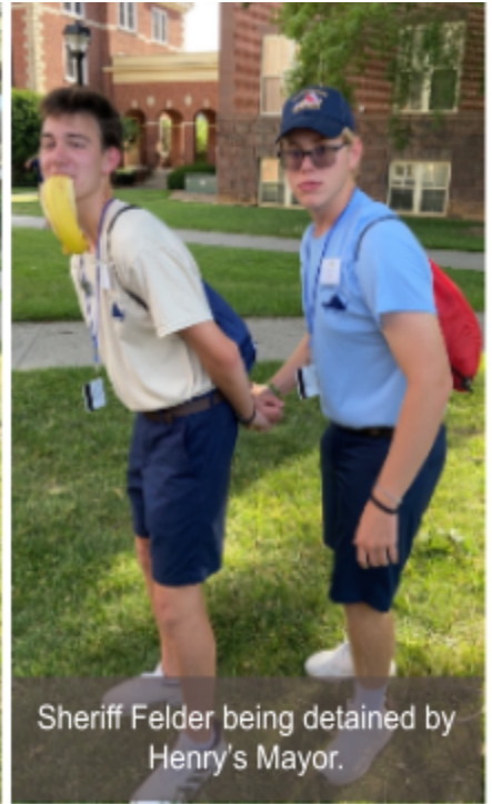
Sheriff Felder being detained by Henry's Mayor.