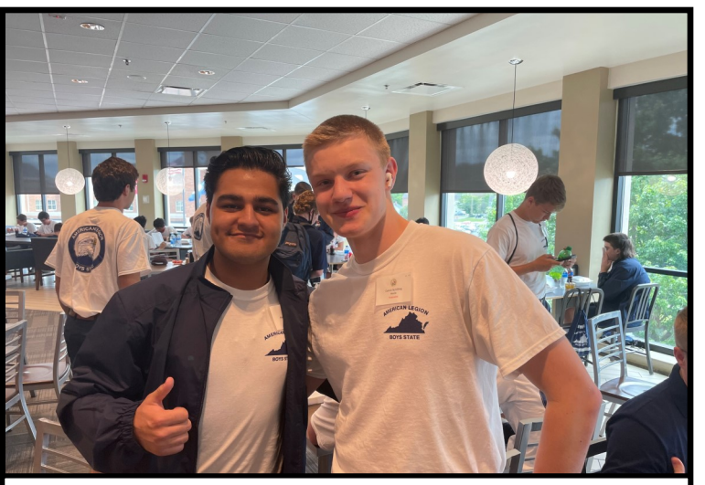
I knew I backed the right candidate!