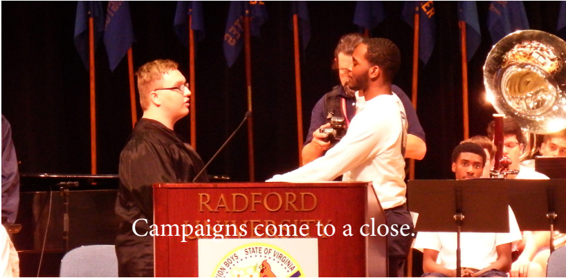
Campaigns come to a close.