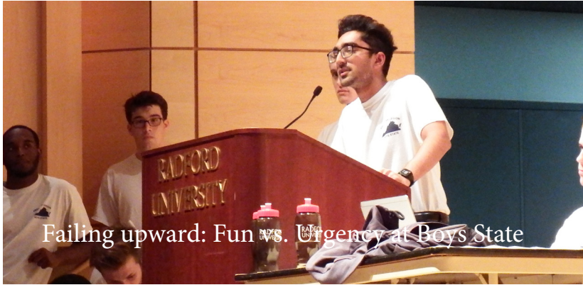
Failing upward: Fun, Frigidity, Urgency at Boys State