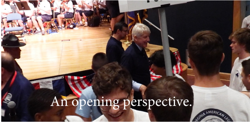
An opening perspective.