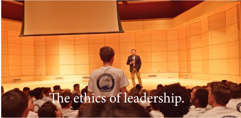
The ethics of leadership.